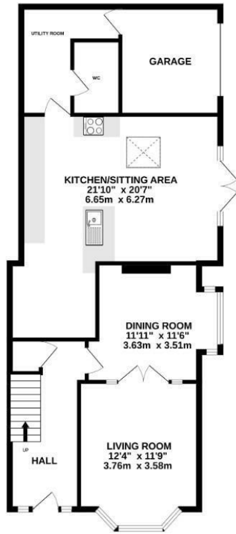
GROUND FLOOR 1001 sq.ft. (93.0 sq.m.) approx.